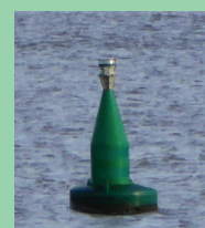
Typical Port and Starboard navigational harbour buoys