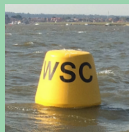
Bank, Pool, Motor Car and Lake buoys

xxxxxxxxxxxxx Landing is not allowed on the banks of the outer harbour.