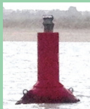
Navigation buoy 10