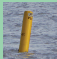
WSC race mark